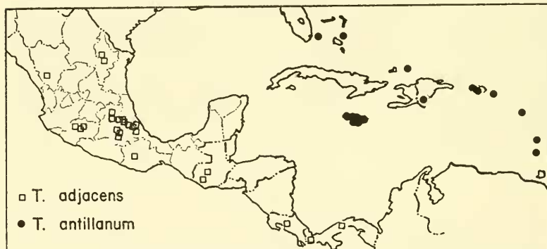
Map 4. Distribution of Theridion adjacens (O. P. Cambridge) and T. antillanum Simon.

Theridion adjacens , Roewer, 1942, Katalog der Araneae , vol. 1, p. 489.